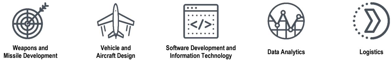
Figure 1. Targeted Industries